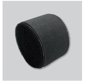
Ceramic heat exchanger with performance up to 93%, protected with a G3 filter at both ends