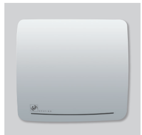
Internal front cover of elegant design, which allows adaptation to any environment.